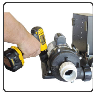
Fig. 7 - After plumbing header is installed, connect pump to base with provided TEK screws, washers and 3/8" drill driver.