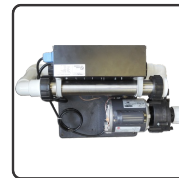
Fig. 9 - PBH1100T system view assembled with timer option shown.