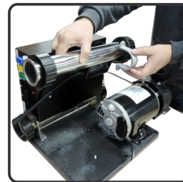
Fig. 4 - Install the booster heater to the control box utilizing the heater clamps. Tighten the heater clamps using the washers and screws provided. *See instructions provided with booster heater.