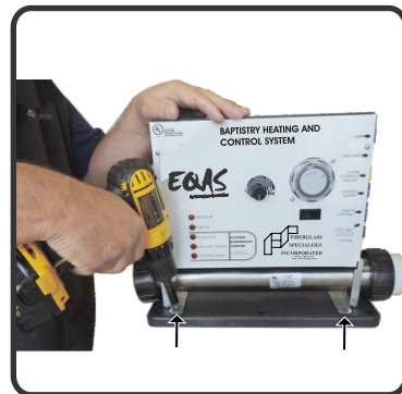
Fig. 2 - Center control box near end of the plastic base and attach using the provided TEK screws and 3/8" drill driver.