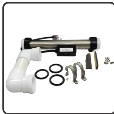
Fig. 3 -Booster Heater Kit