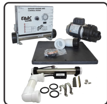
Fig. 1 -Carton Contents PBH1100/PBH1100-T (Timer option shown)

These instructions have been designed to assist in the assembly of the Fiberglass Specialties baptismal control system. Please follow these instructions closely to assure optimal functionality.