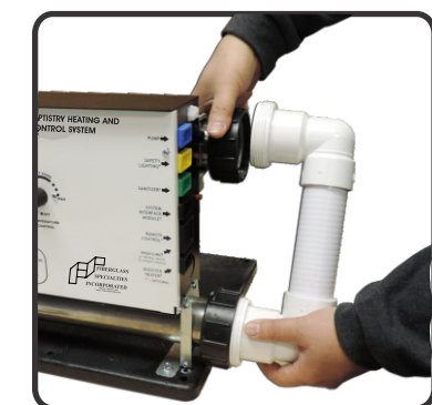
Fig. 5 - Install plumbing header assembly between the main heater and booster heater making sure gaskets are present.